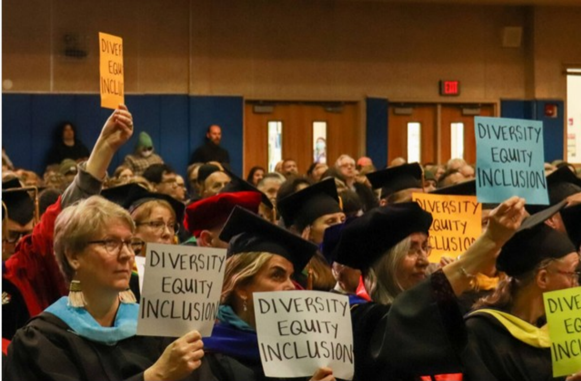
UAS faculty hold up "Diversity, Equity and Inclusion" signs at the University of Alaska Southeast commencement on Sunday, May 4, 2025.