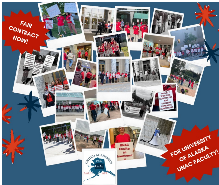
above: photo collage of a few events coordinated by our CCAT during our last round of bargaining in 2021-2022